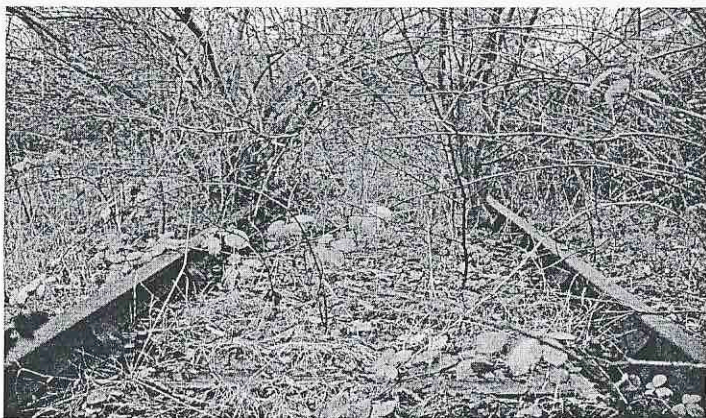
The sad scene at Dunstable where the railway remains but unused