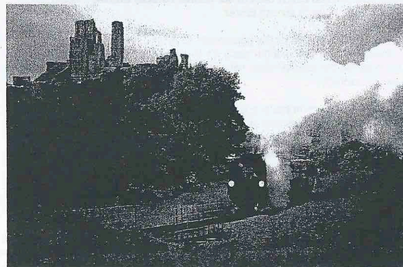
Passing Corfe Castle on the Swanage Railway

Milton Keynes Model Railway Society is associated with: The Chiltern Model Railway Association, The Model Railway Club, The World War 11 Study Group