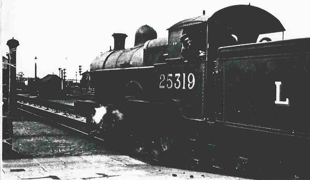
Bletchley in LMS days - a scene we hope to recreate at Bletchley Park