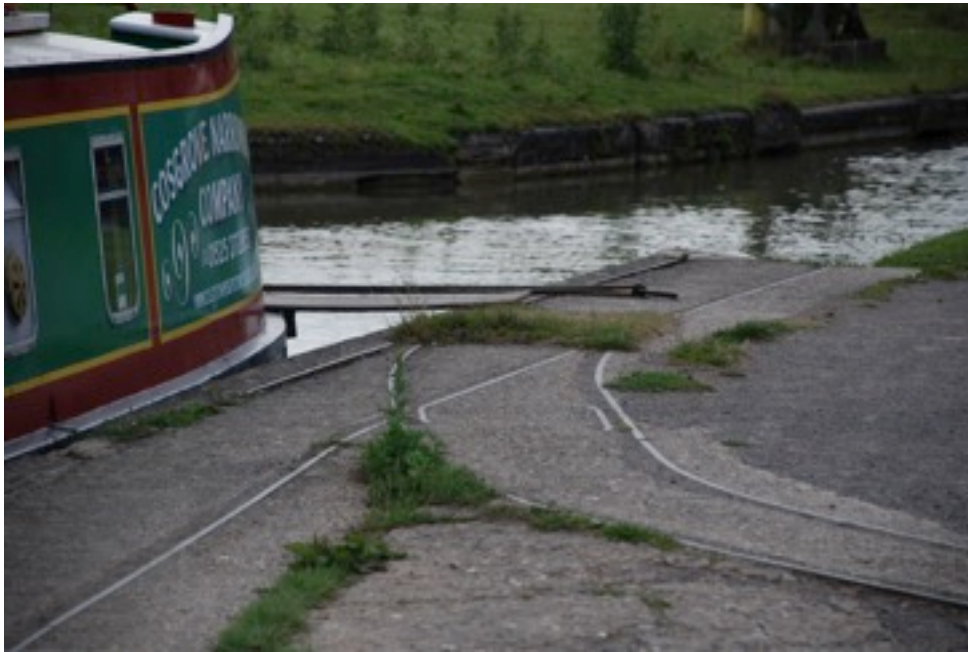
4 – Former loading point for transfer of quarry material to waiting barges