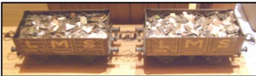
Real scrap metal