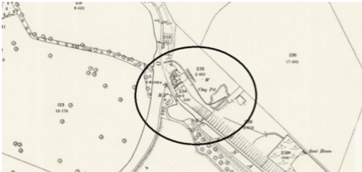
2 – The 1900 O.S 25-inch scale map showed the tramway