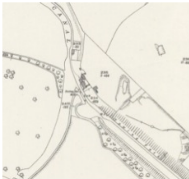
3 - The 1925 O.S map showing a quarry but the railway had gone