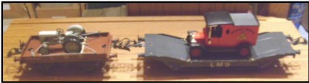
These vehicles caught my eye, whilst wandering around a swapmeet.