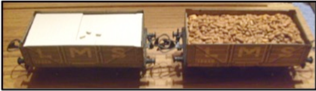
Two Ten Commandment loads, bricks on the left, and sugar beet on the right