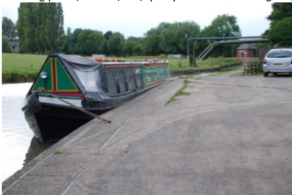
5 – Looking northwards , the triangular junction is evident in the tarmac

The 1952 O.S 6" scale map of the area showed an extensive rail network serving gravel pits which now form the leisure lakes at Cosgrove Park. A publication by the Industrial Railway Society entitled "Industrial Locomotives of Buckinghamshire, Bedfordshire and Northamptonshire" describes a tramway running 800m westwards from a gravel pit to the canalside wharf as being in existence in 1931. The book also states that a Simplex diesel locomotive, MR 9204 built in 1946, was used on the line until 1963 when use of the line ceased. Simplex was the trade name of Motor Rail of Bedford, who supplied many internal combustion locomotives to the War Department for use at The Front in WWI