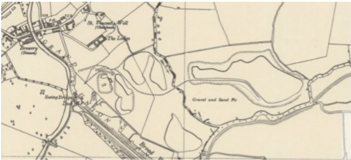
6 – The 1952 O.S 6-inch scale map shows the network of lines serving the pits but not the wharfside triangular junction

In part 3, which will consist of at least three sections, I will be covering different wagons and they're various loads. I will also explain my freight loads, on my layout, and as I have been collecting, on and off for nearly sixty five years, I have been able to assemble a great deal of different loads. These items come from various sources as listed below.