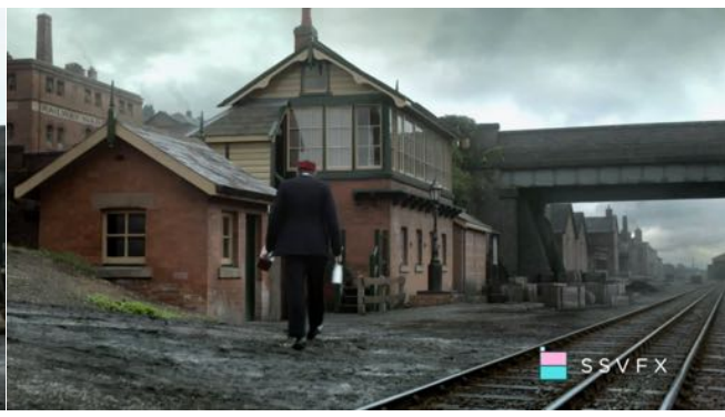
Whitechapel Signal Box