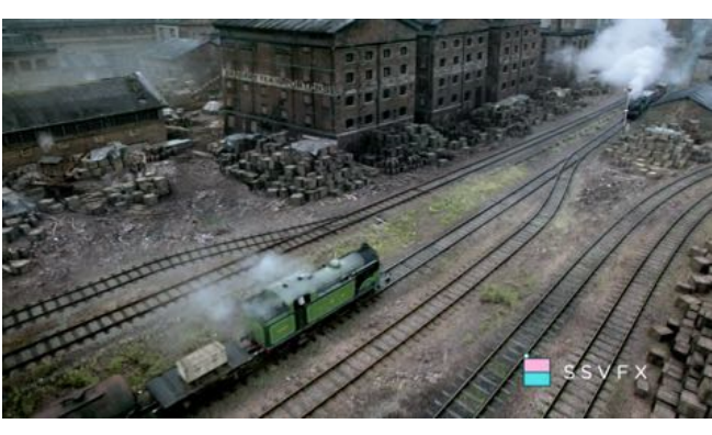
As seen on Ripper Street