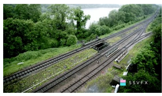
GCR at Mountsorrel