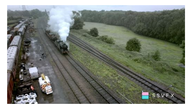
GCR Switherland Sidings

If you watched the first episode of this series, it included a scene involving a number of trains concluding with a train crash. I did send out a link to a video that shows the use of Computer Graphics to transform the Great Central Railway into Whitechapel. Please click here for the <a href="video">video</a> . For those who have not seen it here a few snapshots.