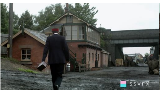
GCR Signal Box at Loughborough