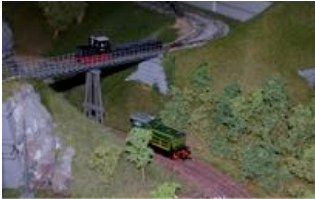
And another bridge close to the unloading facility