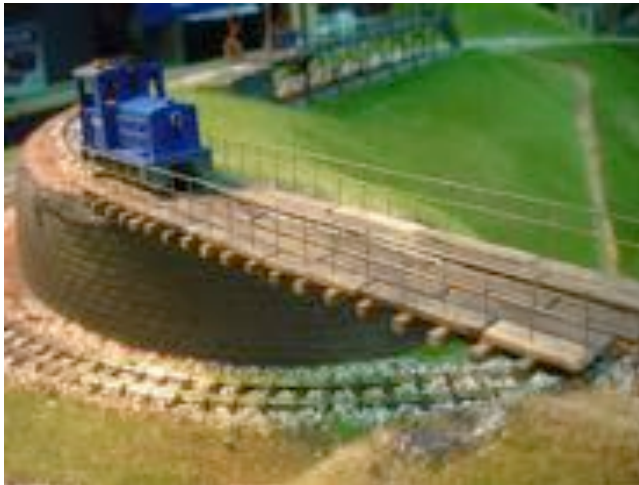
And another bridge close to the unloading facility