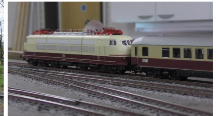
E103 with TEE stock H0 scale

The E103 Class were the main motive power for express trains from 1970 until 2003