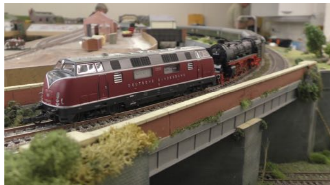
V200 & BR 1.1 H0 scale

The V200 Class were built in 1956 and were the basis of the British Warship Class