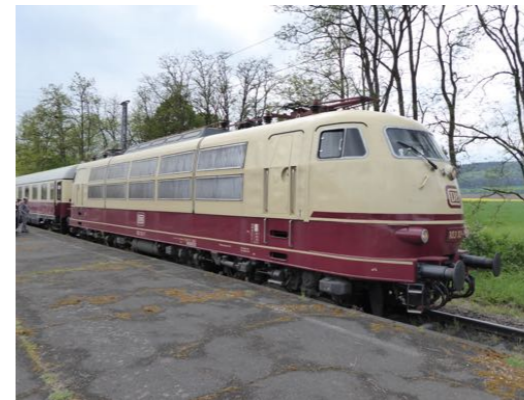
E103 electric loco with TEE stock

** the men in the field were lined up to photograph and film a train at a preserved line