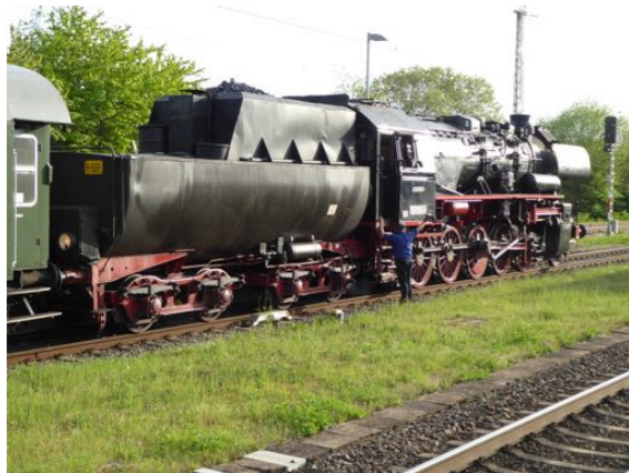
BR 52 Kriegslok 2-10-0 waits at Wittlich