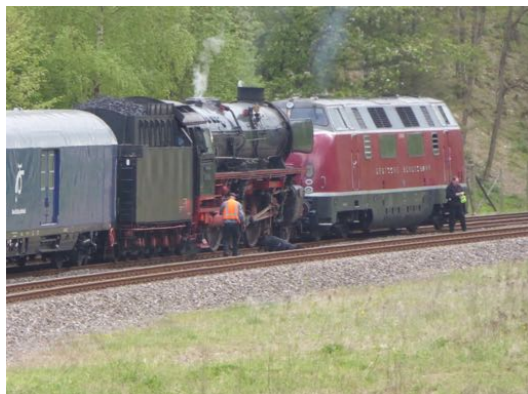
V200 & 01.1 en route to Trier

Seven steam locos were rostered, the oldest being an ex-Prussian 4-6-4 Baltic tank, built in 1923. There were three Pacifics, and four Kriegslok 2-10-0's a German V200 (Warship) diesel and 2 heritage electrics putting in an appearance. We were on an organised tour and travelled from Köln to Trier on a special train hauled by the V200, and a Pacific with the Baltic tank tacked on at the rear.