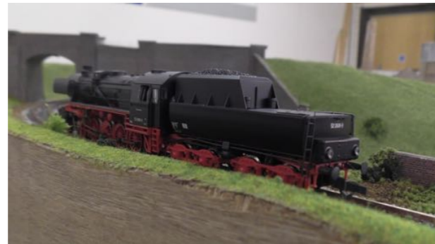
BR 52 Kriegslok 2-10-0 in H0 scale