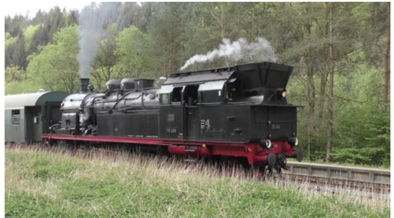
BR78 ex-Prussian Baltic Tank awaits departure from Speicher on the Eifel Route

The E103 Class were the main motive power for express trains from 1970 until 2003