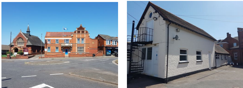
Behind the impressive façade of the old council offices could be found our second home

This rendered the Victoria Road Bletchley UDC headquarters redundant and these were purchased by the Masonic organisation whose own premises in an old school building opposite St. Martins Church in Fenny Stratford were about to be compulsory purchased for road improvements to what was then still the A5 through Fenny Stratford, today it is the V4 and the A5 diversion is still known to many of us as the A5D!