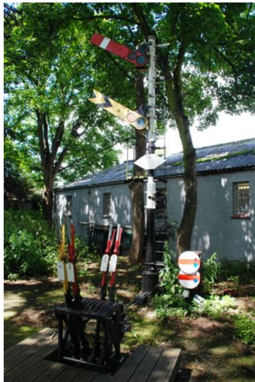
Our working signal display was popular during school visits. The signals were lit too!