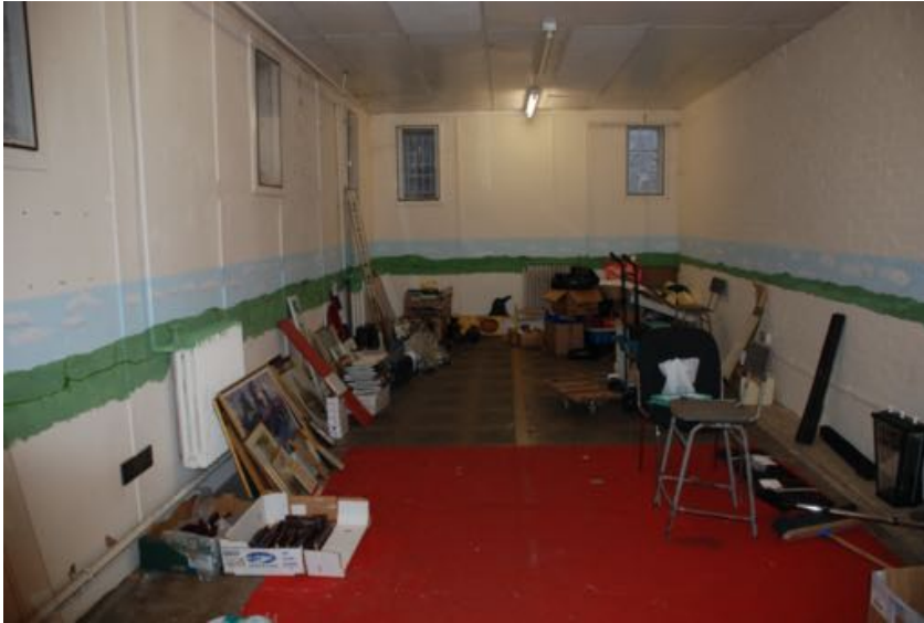
One of the many rooms in our old Bletchley Park building. This one is seen after the removal of our Verney Junction layout.

As a club we suddenly found ourselves in the museum business and for 18 years we played our role in opening-up every weekend, Bank Holidays and for school visits – not to mention at other times as well. During our stay at Bletchley Park our club room was visited by over 200,000 people!