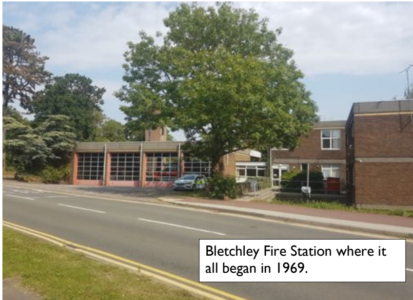
Bletchley Fire Station where it all began in 1969.