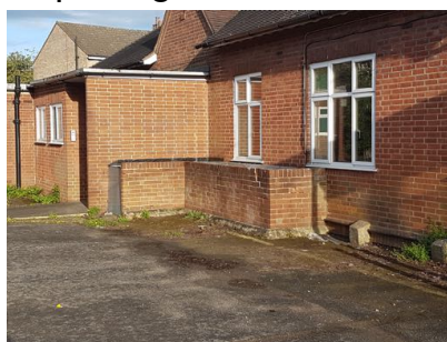
Part of Holne Chase School with the now blocked steps down to the old club room (right)