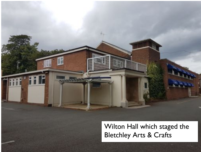
Wilton Hall which staged the Bletchley Arts & Crafts

railway club. Yours truly, then aged 15 put his name on the sheet and 50 years later is still here!