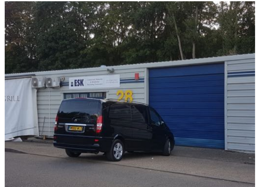
Our home for 3 years at Barton Road

Three years we were there before moving to our current home.