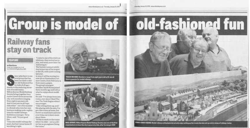
An article from the MK Citizen in January 2016 taken at Barton Road shows we are never far from the spotlight!

club in the sky that they will look down on us with pride that we have survived against the odds and hopefully, will do so again in future.