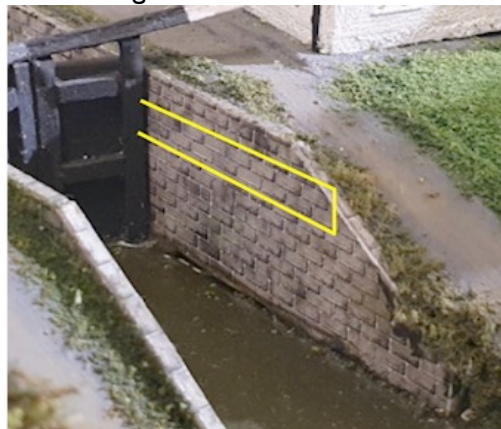
A bit of extension to the bridge brickwork was required and some bushes added to hide what would be behind.

A copy was taken from a picture of the side of the canal lock on the layout; to get the brickwork pattern and this was pasted into the picture, replacing the existing lock sides.