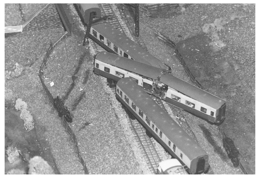
One of the coaches was fire damaged by use of a cigarette!

Thanks for the welcome that I have already received.